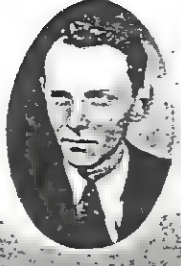
Lyle Brown Men's Clothing Retail